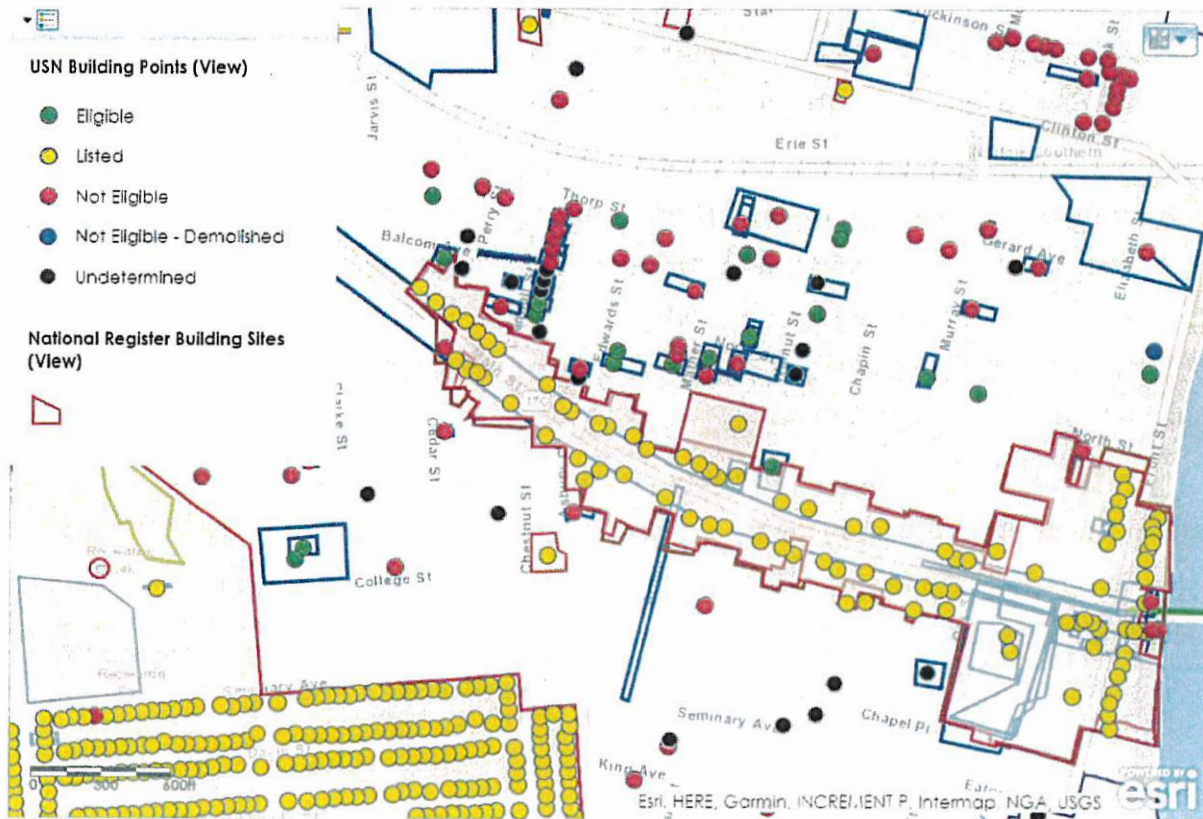
NYS Cultural Resource Information System