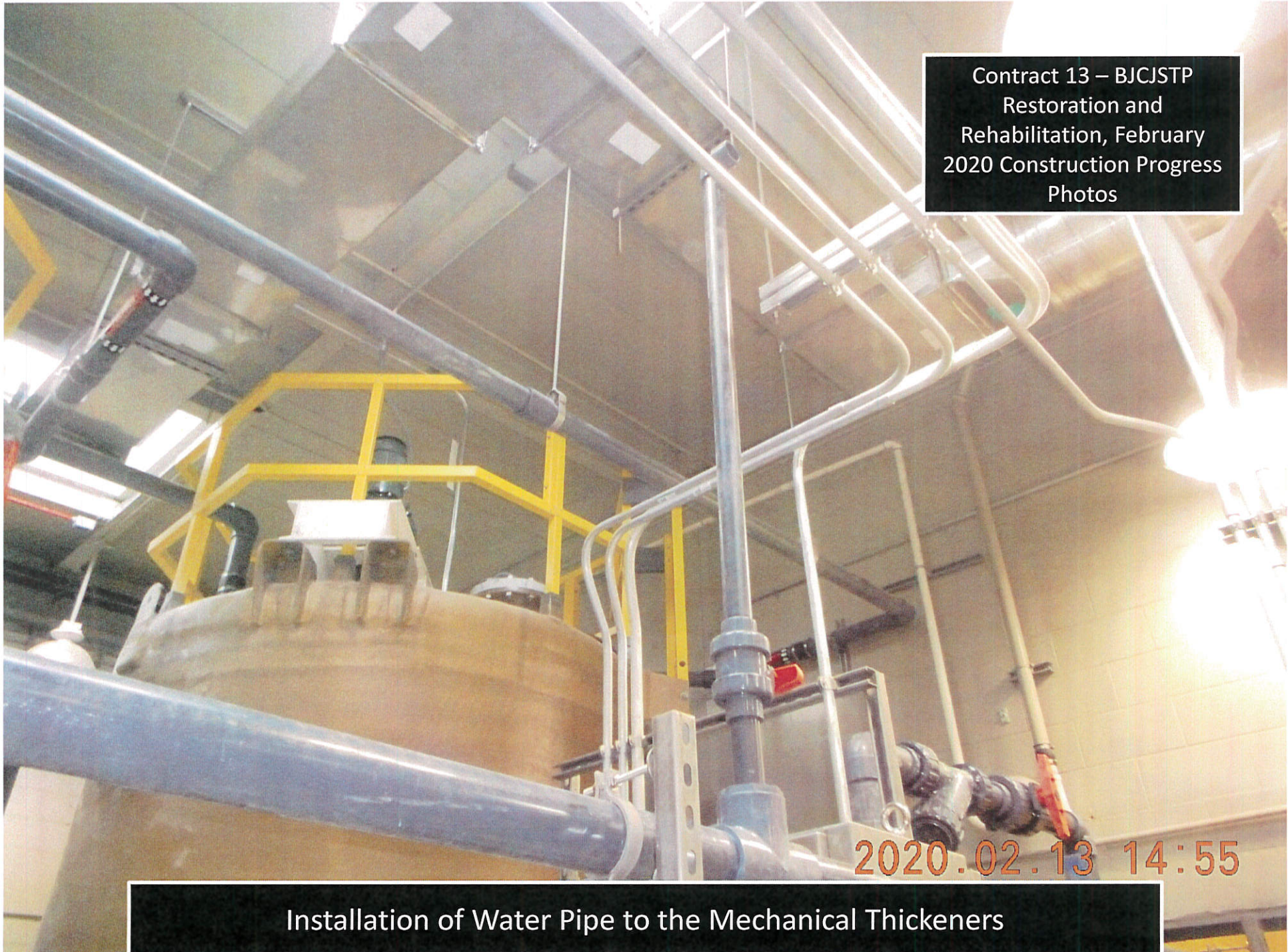
Installation of Water Pipe to the Mechanical Thickeners