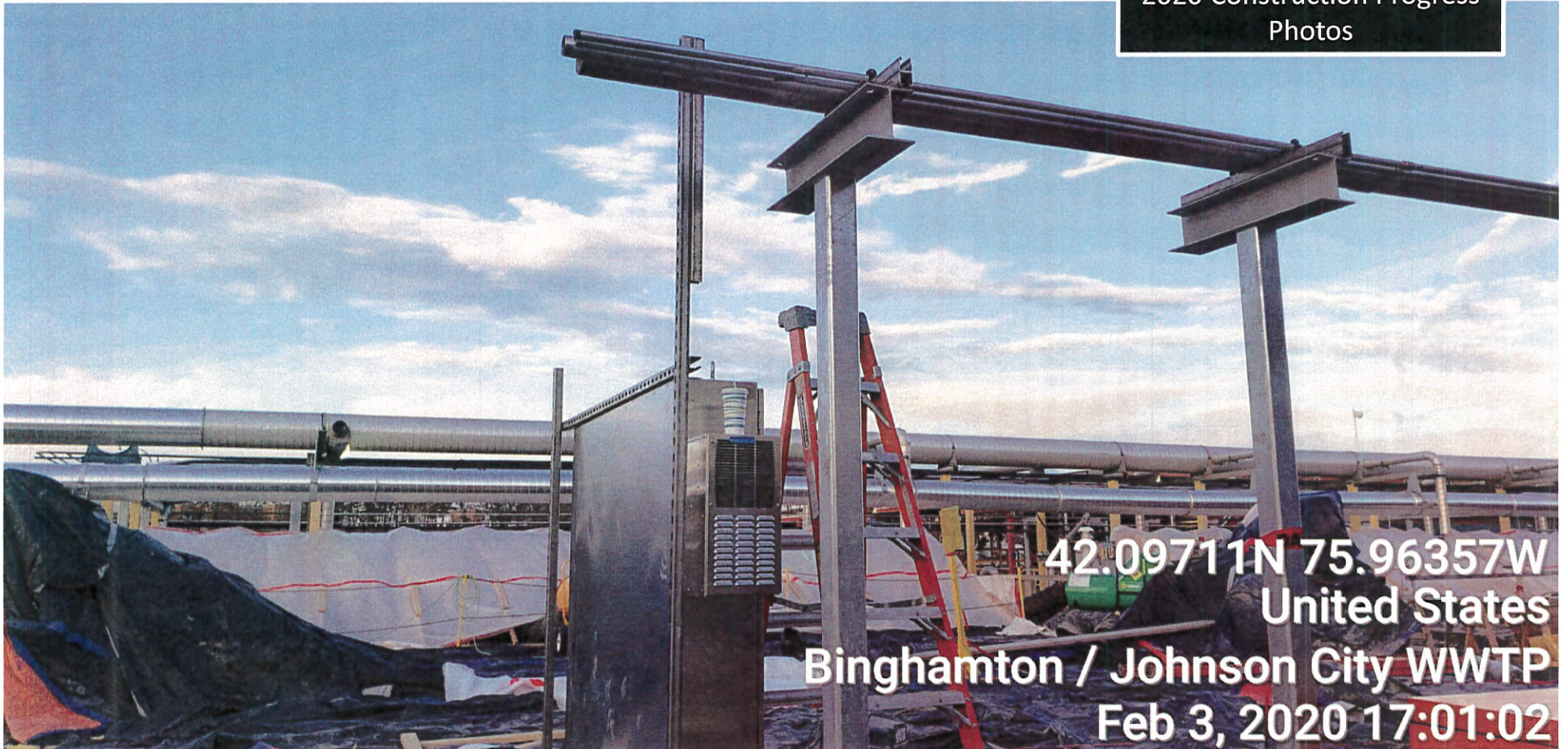
Conduits to PST 6 Control Panel

Contract 6 – BJCJSTP Restoration and Rehabilitation, February 2020 Construction Progress Photos